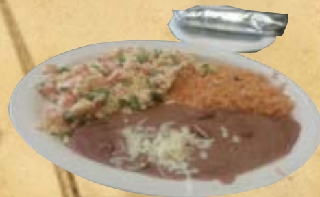
Huevos A la Mexicana